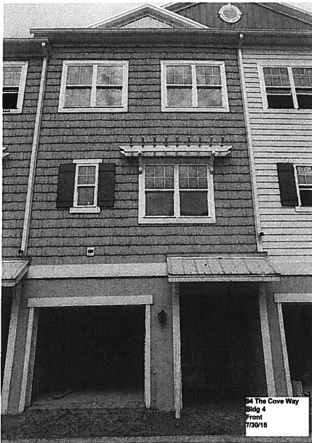
94 The Cove Way Bldg 4 Front 7/30/15

If using the Elevation Certificate to obtain NFIP flood insurance, affix at least 2 building photographs below according to the instructions for Item A6. Identify all photographs with date taken; "Front View" and "Rear View"; and, if required, "Right Side View" and "Left Side View." When applicable, photographs must show the foundation with representative examples of the flood openings or vents, as indicated in Section A8. If submitting more photographs than will fit on this page, use the Continuation Page.