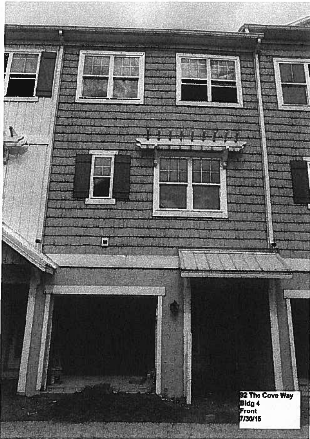
92 The Cove Way Bldg 4 Front 7/30/15

If using the Elevation Certificate to obtain NFIP flood insurance, affix at least 2 building photographs below according to the instructions for Item A6. Identify all photographs with date taken; "Front View" and "Rear View"; and, if required, "Right Side View" and "Left Side View." When applicable, photographs must show the foundation with representative examples of the flood openings or vents, as indicated in Section A8. If submitting more photographs than will fit on this page, use the Continuation Page.